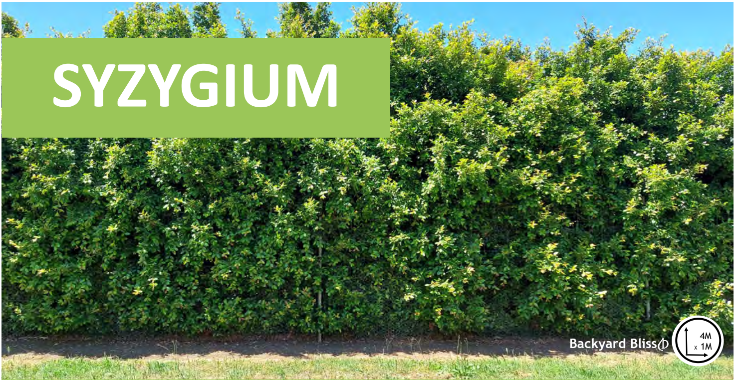
Backyard Bliss (b)