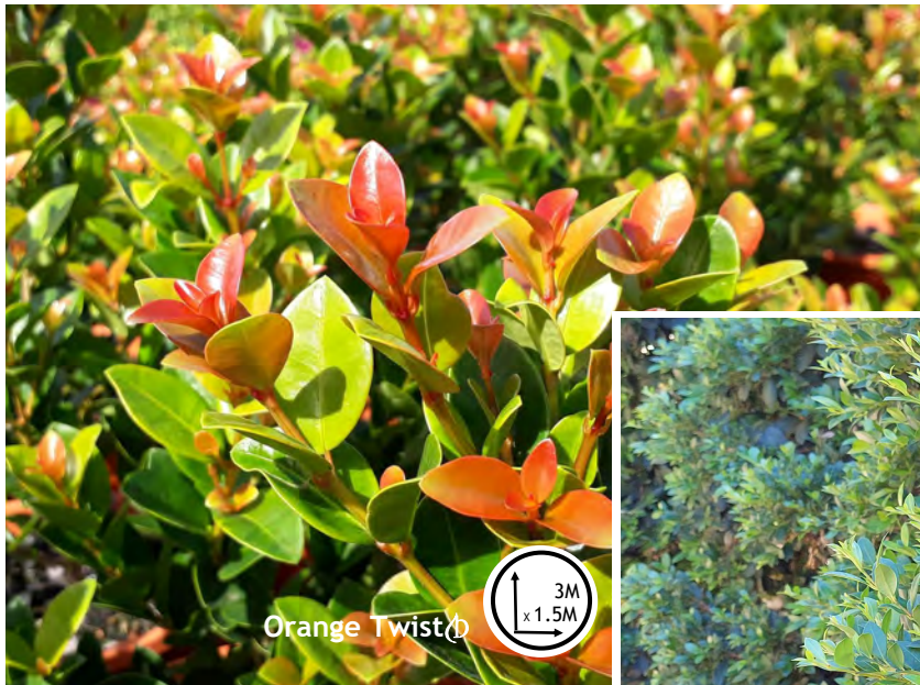
Orange Twist (b)

australe Straight and Narrow 'SAN01' pbr australe Tiny Trev Tucker Bush oleosum Blue Lilly Pilly australe Winter Lights (b)