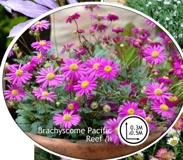
Brachyscome Pacific Reef (b)

Vibrant purple/pink flowers are the striking feature of this Brachyscome . It has a compact, suckering growth habit. Great for planting along pathways as a border plant and in containers.