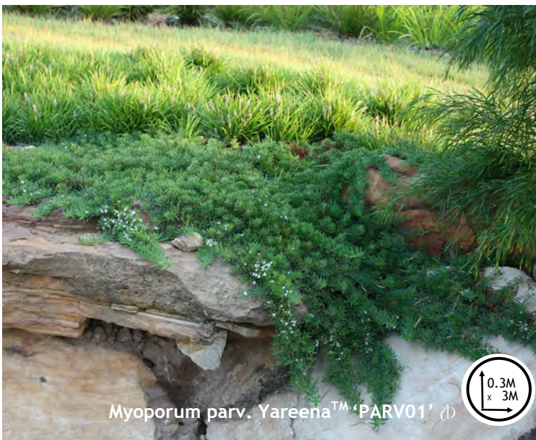
Myoporum parv. Yareena™ 'PARV01' (b)

Hibbertia scandens Myoporum Yareena™ 'PARV01' (b) Osteospermum Voltage Scaevola Aussie Crawl Scaevola Purple Fanfare Trachelospermum Flat Mat™ 'FT01' (b) Trachelospermum jasminoides