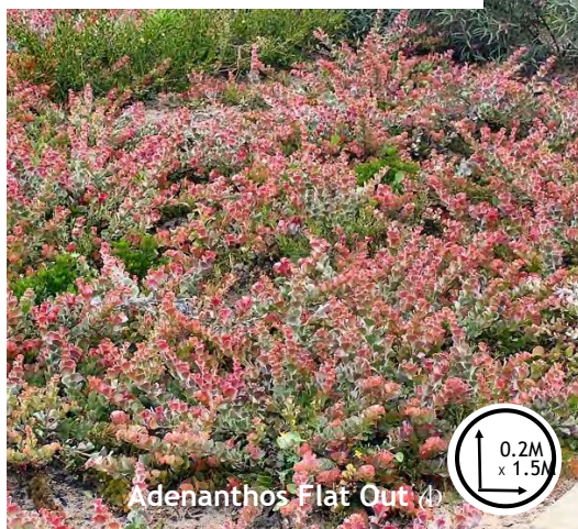
Adenanthos Flat Out (b)

Low water requirements once established.