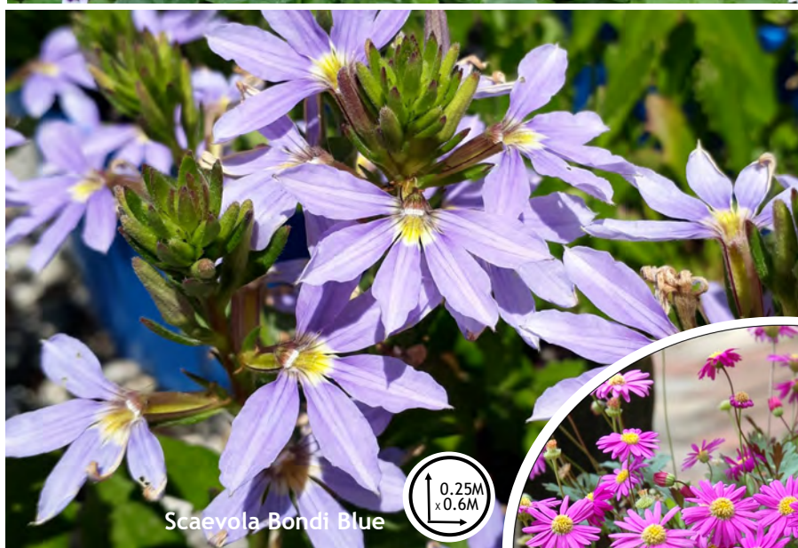
Scaevola Bondi Blue