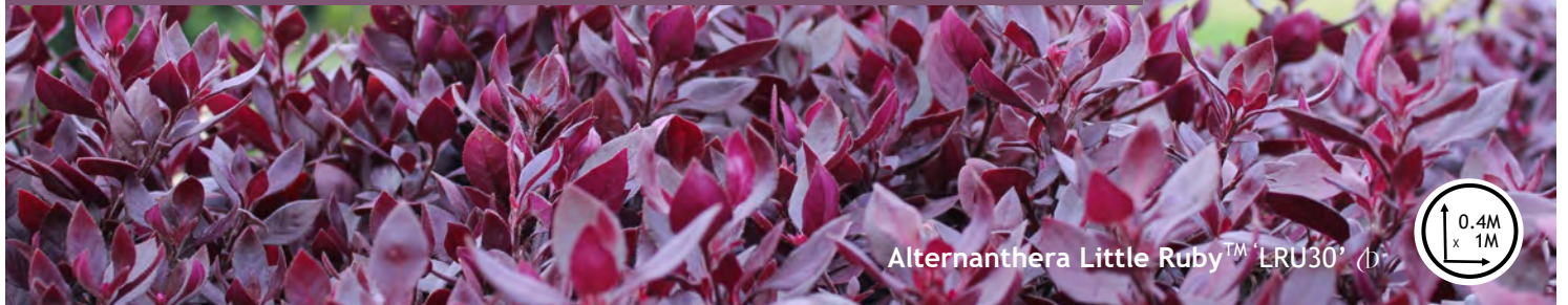
Alternanthera Little Ruby™ 'LRU30' (b)