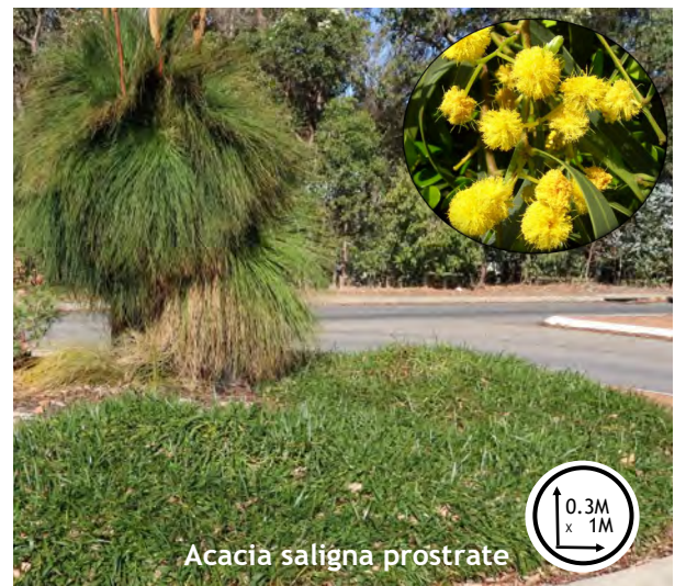
Acacia saligna prostrate