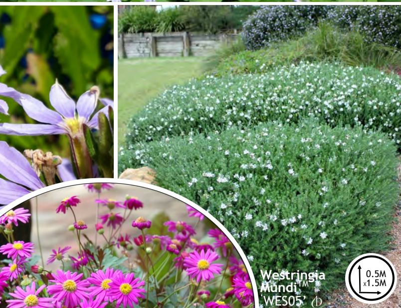
Westringia Mundi ™ 'WES05' (b)