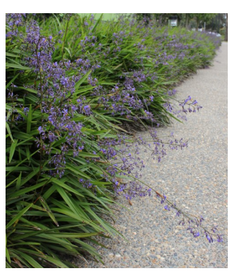
D LITTLE JESS<sup>TM</sup> DCMP01 (b) is a caerulea cultivar with short compact canes that don't fall over like the ones on the common form. Good cold tolerance.

Full sun, moderate to heavy shade. H 40cm W 40cm