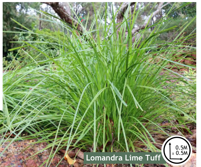
Lomandra Lime Tuff

Lomandra 'Lime Tuff' is a resilient, low-maintenance grass known for its compact habit and vibrant lime-green blades. It produces fragrant yellow flower spikes in summer and, once established, requires very little water. This versatile variety is an ideal choice for coastal gardens, mass plantings, or as an effective understorey filler.