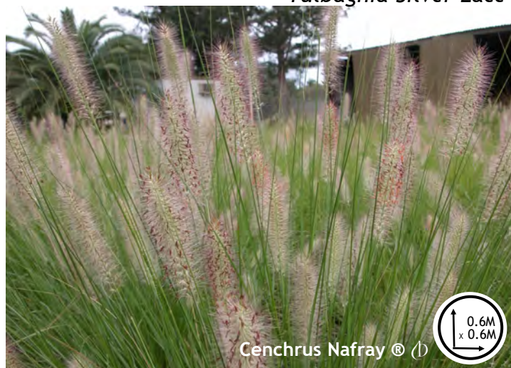
Cenchrus Nafray® (P)

Carex 'Moon Falls' (P) is a vibrant, low-maintenance ornamental sedge featuring elegant green and white variegated foliage. Its compact, weeping habit stays neat year-round, making it a reliable choice for garden borders, decorative containers, and mass landscape plantings.