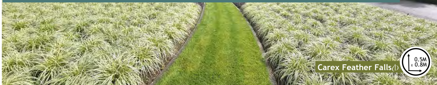
Carex Feather Falls (P)