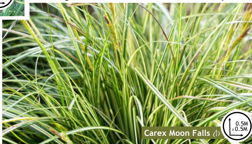
Carex Moon Falls (P)

Cenchrus 'Nafray' (P) is a resilient, clumping grass with fine, arching foliage. From summer through autumn, it produces elegant, feathery plumes. Highly drought-tolerant and adaptable 'Nafray' is an excellent choice for rock gardens and low-maintenance landscapes.