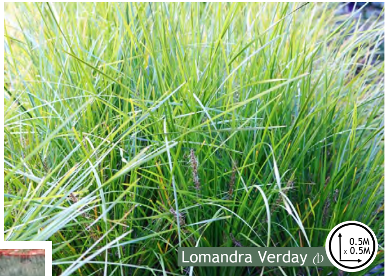
Lomandra Verday (D)

Lomandra Verday is a versatile, low maintenance native grass featuring bright green foliage with a graceful arching habit that adds year round elegance. In spring and autumn it produces fragrant yellow flower spikes. Verday is exceptionally drought and frost tolerant adapting to most soil types.