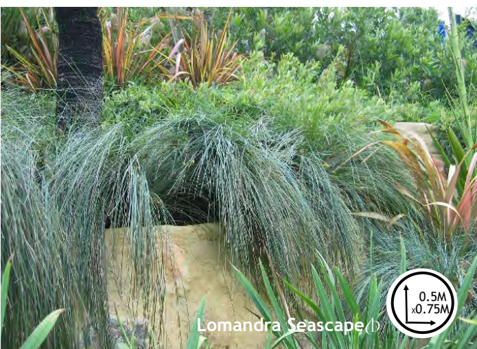
Lomandra Seascape (P)

Carex 'Feather Falls' (P) is a highly decorative ever-green sedge known for its striking cascading habit and resilient nature. Its long, crisp leaves feature a vivid variegated pattern of rich green with creamy white edges, maintaining a "fresh" look throughout the year.