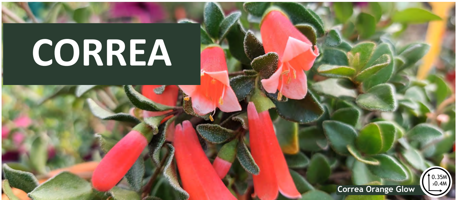
Correa Orange Glow