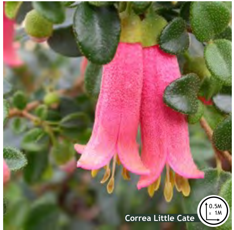
Correa Little Cate

Correa Little Cate is a delightful cultivar with a naturally neat, compact habit. It has a beautiful display of delicate pink, bell-shaped flowers from late summer through winter. An ideal feature plant for containers or gardens where space is limited.