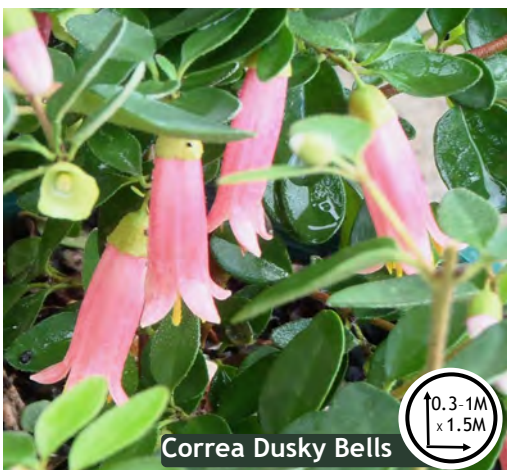
Correa Dusky Bells