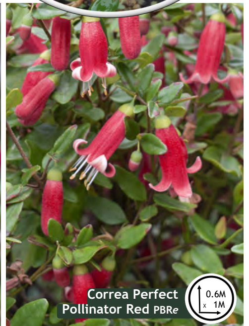
Correa Perfect Pollinator Red PBR e