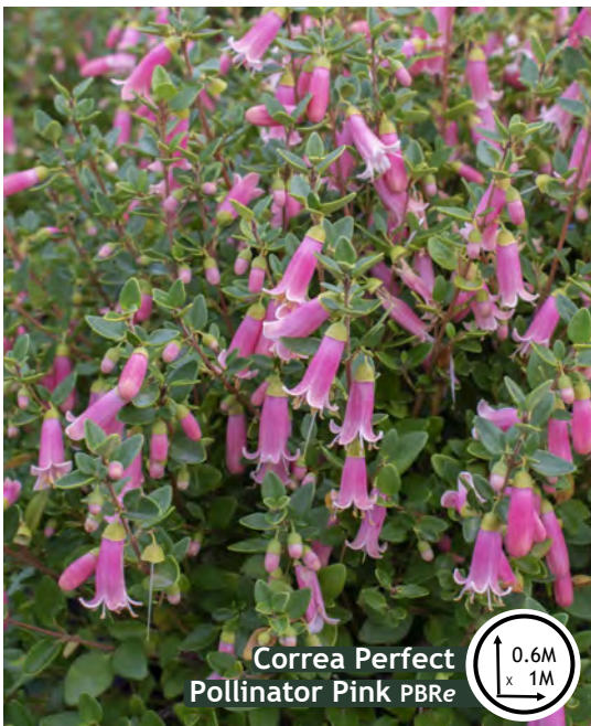
Correa Perfect Pollinator Pink PBR e