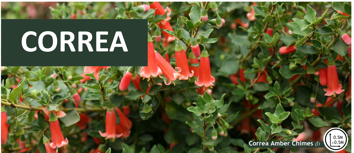
Correa Amber Chimes (P)