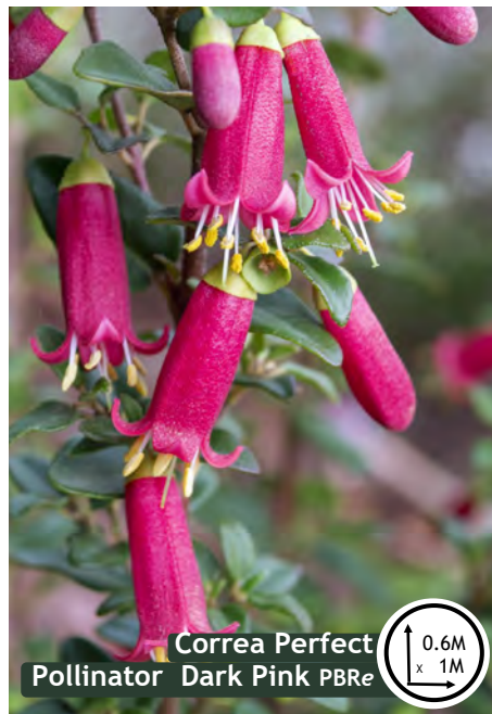
Correa Perfect Pollinator Dark Pink PBR e