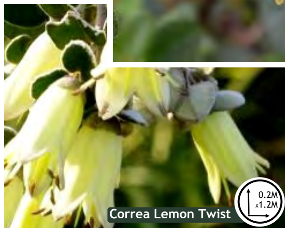
Correa Lemon Twist