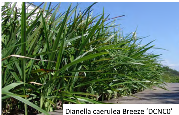
Dianella caerulea Breeze 'DCNC0'

Grasses also produce beautiful flowers that invite Australian native bees and specialist bees alike. Varieties like this Dianella Breeze are also very hardy once established.