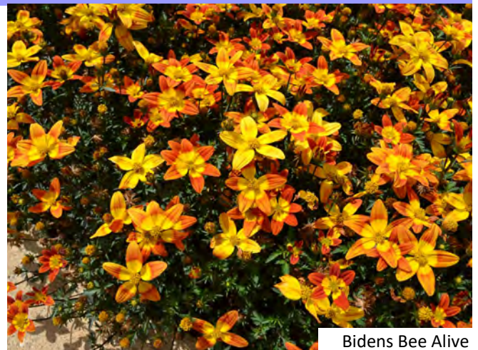
Bidens Bee Alive

Full Sun to Light Shade H 25cm W 60cm 175mm Pot