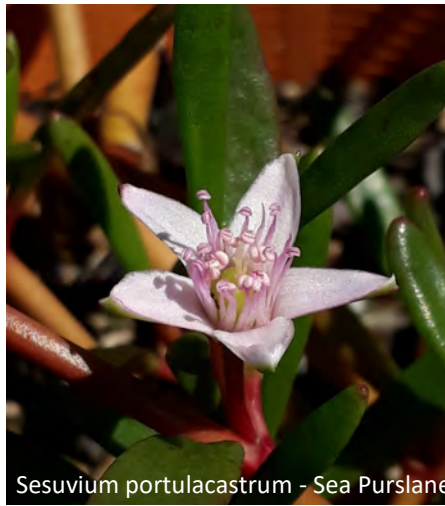
Sesuvium portulacastrum - Sea Purslane

Sea Purslane is a fast growing groundcover with succulent like foliage. The leaves of this Tucker Bush plant can be eaten raw or cooked. It is salt and drought tolerant that grows well in pots. 140mm Pots Click for more great Tucker Bush plants for attracting pollinators.