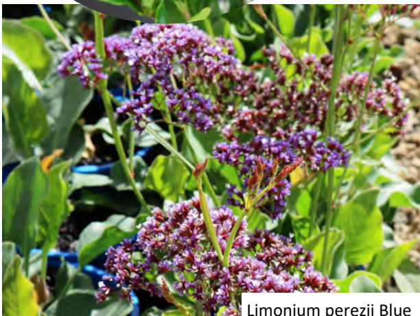
Limonium perezii Blue

Sea Purslane is a fast growing groundcover with succulent like foliage. The leaves of this Tucker Bush plant can be eaten raw or cooked. It is salt and drought tolerant that grows well in pots. 140mm Pots Click for more great Tucker Bush plants for attracting pollinators.