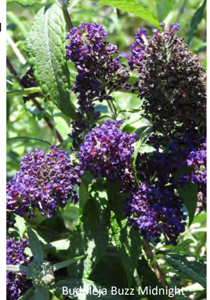
Buddleja Buzz Midnight