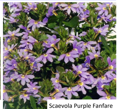
Scaevola Purple Fanfare