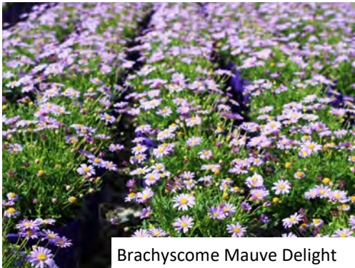
Brachyscome Mauve Delight

Brachyscomes are easy care, low growing plants that flowers for most of the year with mauve, daisy like flowers. Great for both landscapes and containers.