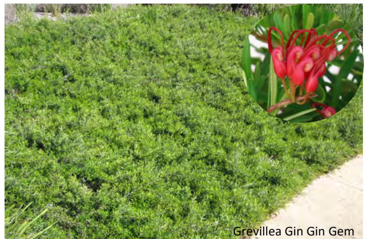
Grevillea Gin Gin Gem

Grevillea obtusifolia Gin Gin Gem is a dense, groundcover with a prolific display of red spider flowers in winter and spring. It is ideal for native gardens, landscapes and roundabouts. Once established it will only require the occasional water in the heart of Summer.