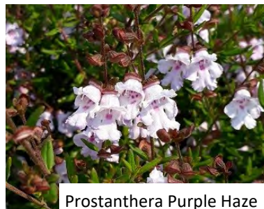
Prostanthera Purple Haze

Prostanthera's like the pictured P. Purple Haze are commonly pollinated by bees but also attract small birds. The aromatic 'Mint Bush' grows well in full sun to lightly shaded positions producing an abundance of flowers from throughout Spring. Once established they require only minimal water. 175mm Pot varieties available