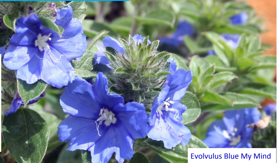
Evolvulus Blue My Mind

Evolvulus 'Blue My Mind' (D) A compact shrub to 30cm with flowers for most of the year. Pruning throughout the year will maintain shape and encourage further flowers.