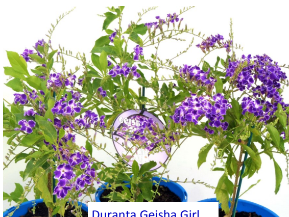
Duranta Geisha Girl

Lobelia Lucia Dark Blue is a colourful bedding plant. The vivid flowers contrast against other plants in the garden. They look stunning planted en masse in garden beds or in containers. Plant in full sun to part shade. Fertilize regularly to promote flowering. H 20-25cm W 30-40cm 140mm Pot