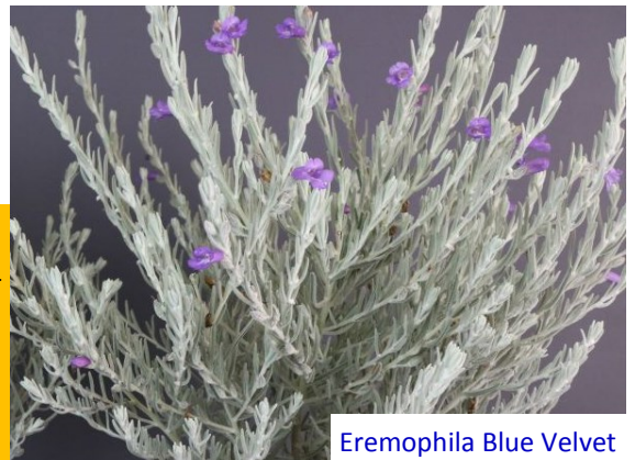
Eremophila Blue Velvet

Plumbago Royal Cape produces abundant clusters of deep blue flowers from late Spring to Autumn. A hardy shrub for garden beds or pots. H 1.2 to 2m W 1.5 to 2m 140mm Pot