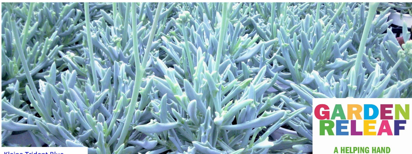
Kleinia Trident Blue